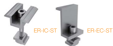
Inter and End clamps

The STIII-A supports are completely pre-assembled, they only need to be unfolded and secured to the foundation. The anodised aluminium alloy profiles are connected with stainless steel fasteners. Furthermore through this new design the legs can be adjusted vertically by 50mm allowing for adjustments in case the foundation requires it. For larger projects the positioning rail clamps can be preassembled**, which means that the rail positions don't have to be measured.